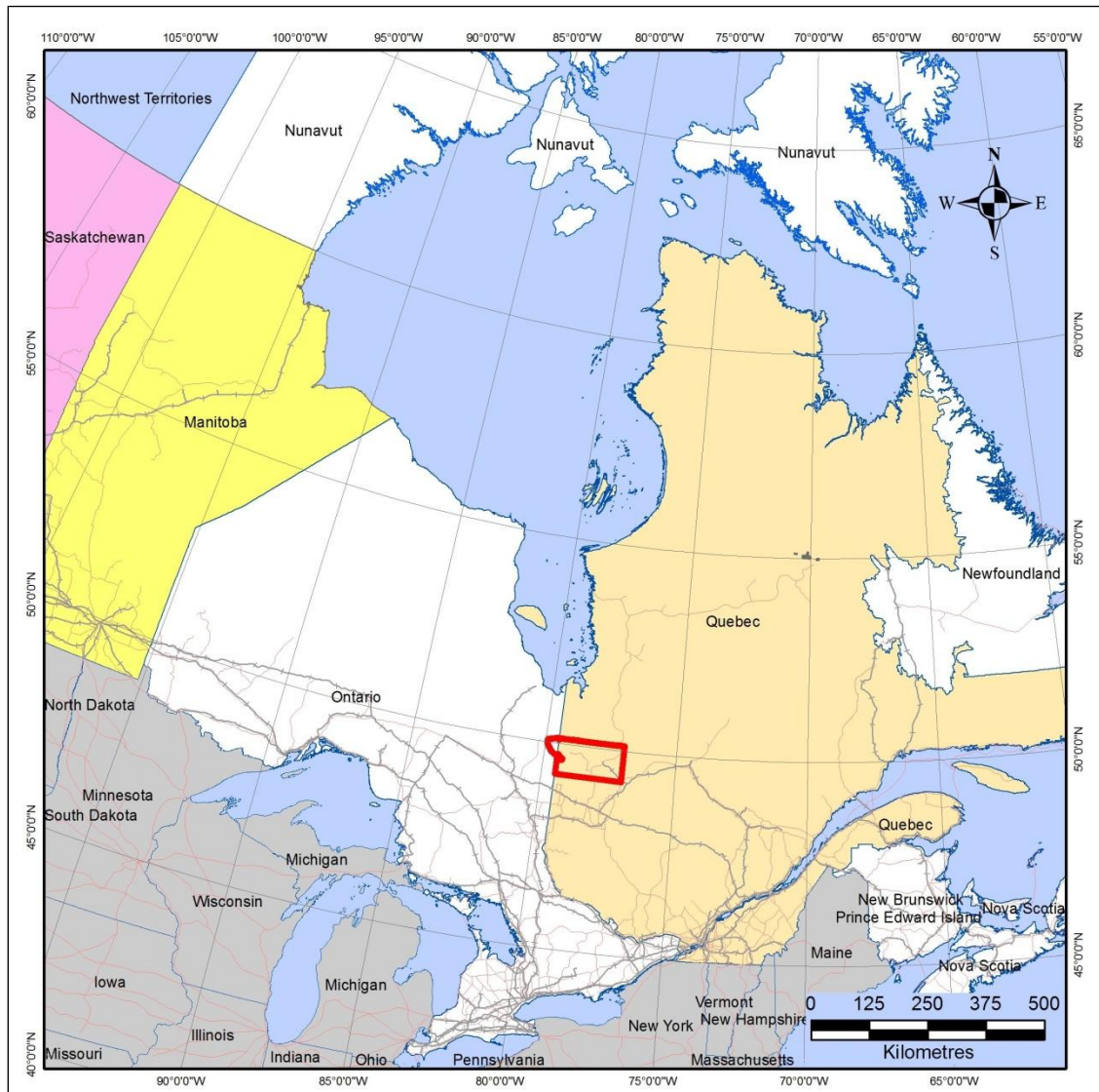
Figure 1 : Detour Quebec Orogenic Gold Project Location